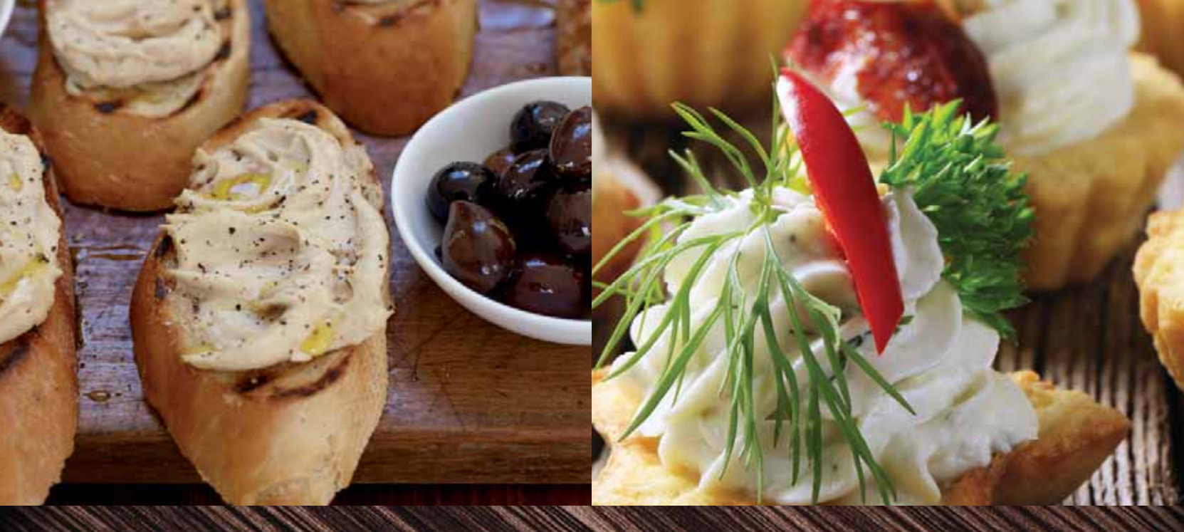
Food imagery indicative only.